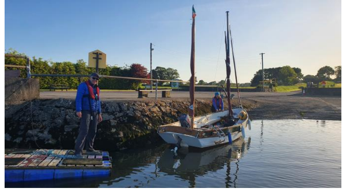
2, Launching, Polerone Quay.