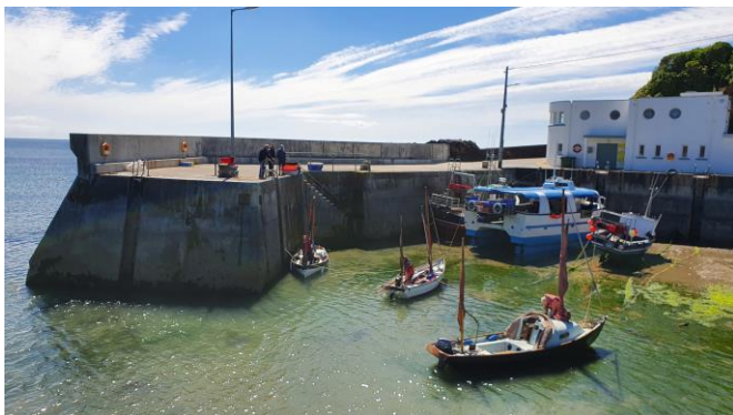
5, Sunday break at Boatstrand.