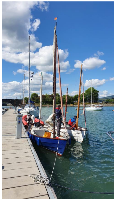
6, the pontoon at Dungarvan