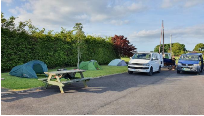
1, Polerone Quay, camping Friday night.