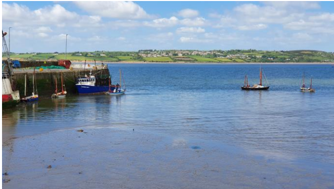
3, Saturday lunch stop at Duncannon.