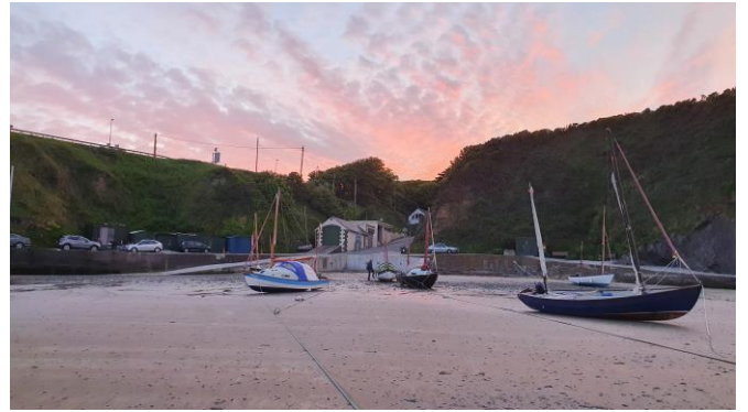
4, taking the hard at Tramore.